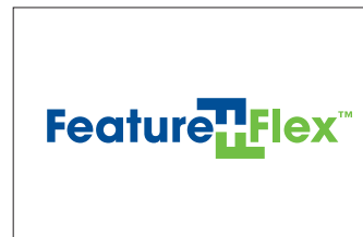
User Adaptable Solutions